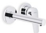
WE00198, SY97199CR Wall-mounted single control mixer tap with 150 mm spout