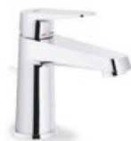
SY97116/1CR Single control mixer tap