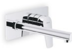
WE00198CR, SY97198/1CR Wall-mounted single control mixer tap with 200 mm spout