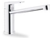
SY97113/25CR Single control mixer tap with 360° swivelling body