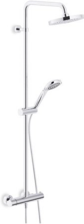
SY97030/30CR External thermostatic mixer, swivel shower head ø 200 mm with rain jet, single jet shower head