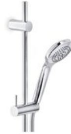
AD140/23CR 650 mm wall rail with single jet shower head