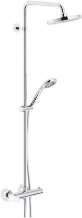
SY97130/30CR External single control mixer, swivel shower head ø 200 mm with rain jet, single jet shower head