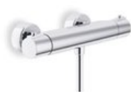
SY97030CR External thermostatic mixer tap