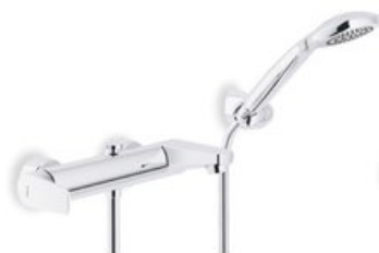
SY97110CR External single control mixer tap with duplex