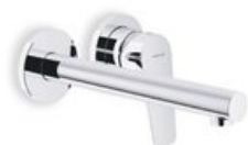
WE00198, SY97199/1CR Wall-mounted single control mixer tap with 200 mm spout