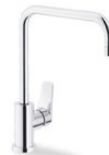
SY97134CR Single control mixer tap with swivelling spout