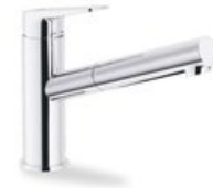
SY97117CR Single control mixer tap with swivelling body and single jet pull-out shower head