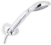
AD146/18CR Directional support with single jet shower head