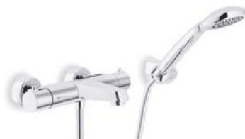
SY97010CR External thermostatic mixer tap with duplex