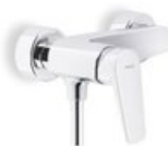
SY97130CR External single control mixer tap