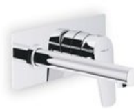
WE00198CR, SY97198CR Wall-mounted single control mixer tap with 150 mm spout