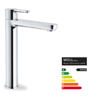
ABE87128/2CR Energy saving single control washbowl mixer tap