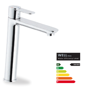
SAE99128/2CR Energy saving single control washbowl mixer tap