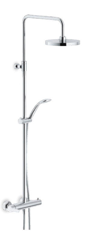
AB87130/50CR External single control mixer with telescopic External thermostatic mixer, swivel rail, swivel shower head ø 200 mm with rain jet, single jet shower head