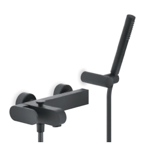
UP94110CR External single control mixer tap with duplex