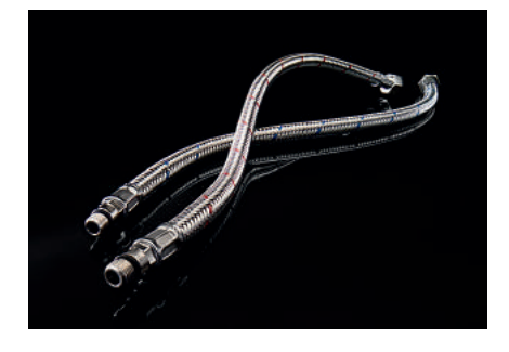
Flessibili NPI Italia Parinox® Softpex®

The ideal component to provide that extra touch of perfection to the bathroom setting: the special metal-effect finish enhances the tap system, while the smooth surface prevents the annoying twisting typical of traditional hoses.