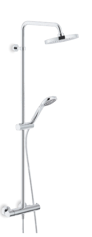
SY97030/30CR External thermostatic mixer, swivel shower head ø 200 mm with rain jet, single jet shower head