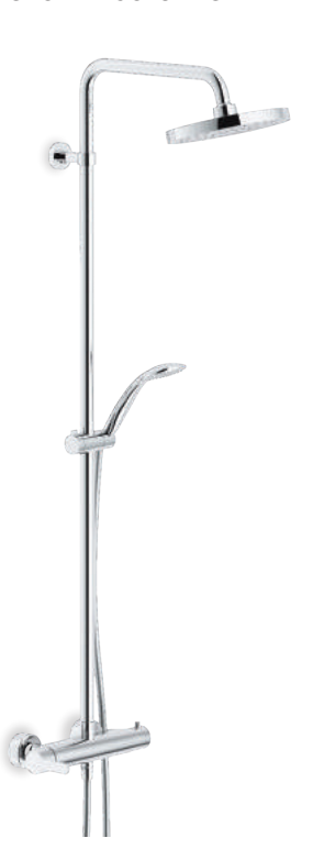
AB87130/30CR External single control mixer, swivel shower head ø 200 mm with rain jet, single jet shower head