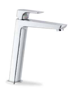
W103128/2CR Single control washbowl mixer tap