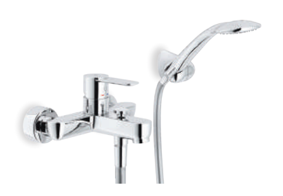
SA99110CR External single control mixer tap with duplex