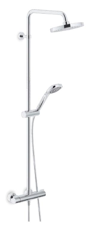
AB87030/30CR shower head ø 200 mm with rain jet, single jet shower head