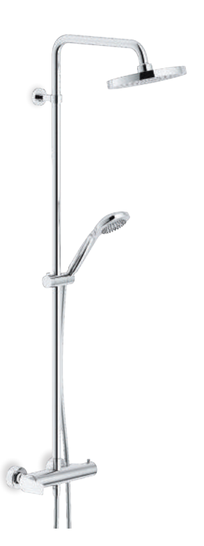
SY97130/30CR External single control mixer, swivel shower head ø 200 mm with rain jet, single jet shower head