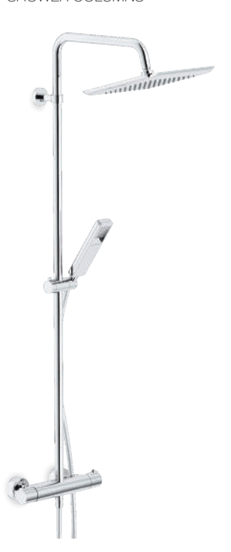
W103030/31CR External single control mixer, swivel shower head 245 x 245 mm with rain jet, single jet shower head